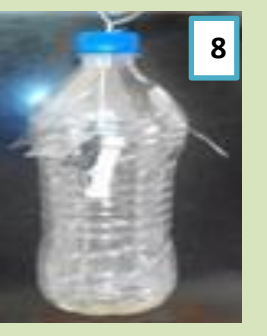
Hang the bottle in shade at least 3-4 feet above ground level at different locations.