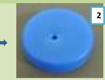
Make a small hole in the centre of the cap/ lid with a needle.