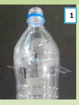
Make 3 windows of 1 inch each with a knife at 3 inches from top of used 1 litre water bottle.